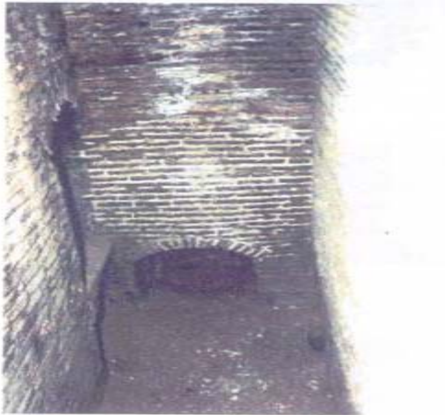
Figure 4. water way of Yagmaey reservoir in Shahrood