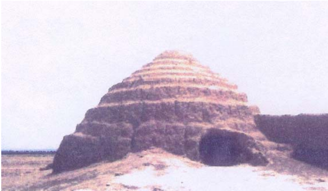
Figure 5. One kind of old refrigerator in Mazaj village, Shahrood

Study of water resources in Shahrood reveal that any house in this city had personal reservoir in past (Divandary, 2000). Yagmaey house reservoir is one of the this reservoirs. Figure 4 shows some part of this reservoir. Another reservoir is Ali Akbar mosque reservoir which is big and famous to forty stair. Galeh School Reservoir and Mirza Ahmad Reservoir which is situated in Bastam are other reservoirs in this area.