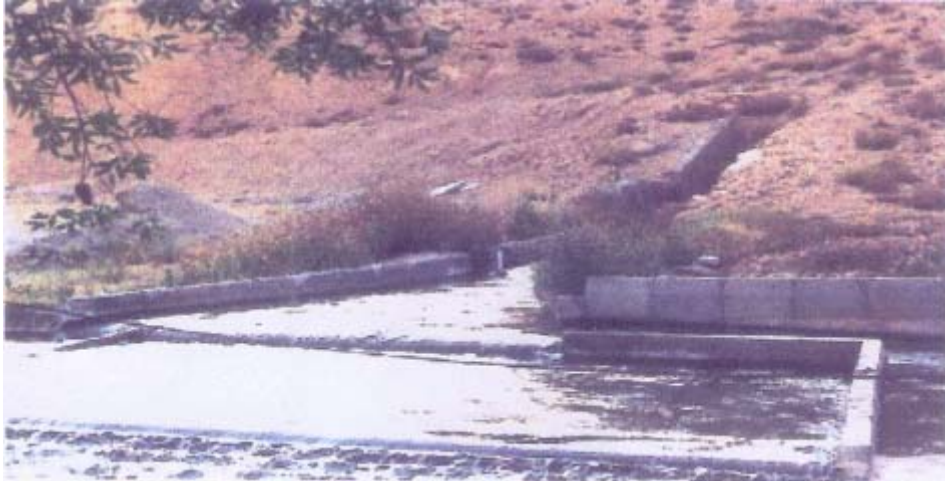
Figure 3. Shahrood City ganat