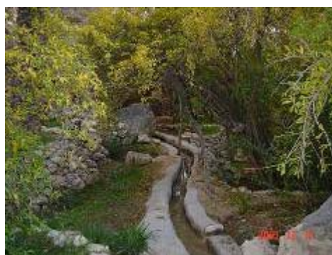
Falaj Al-Jeela: Water collection basin ( left ). Irrigation water distribution system ( right )