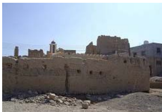
Falaj Al Muyassar: Distribution channels of the shari'a (left). Old houses with mosque (right)

The total cultivated area is 1,133,698 m 2 by means of two main branches. Dates, lemons, fodder and seasonal crops are the most common cultivated crops. To prevent pollution of the falaj and groundwater a wastewater collection system is under construction within the demand area.