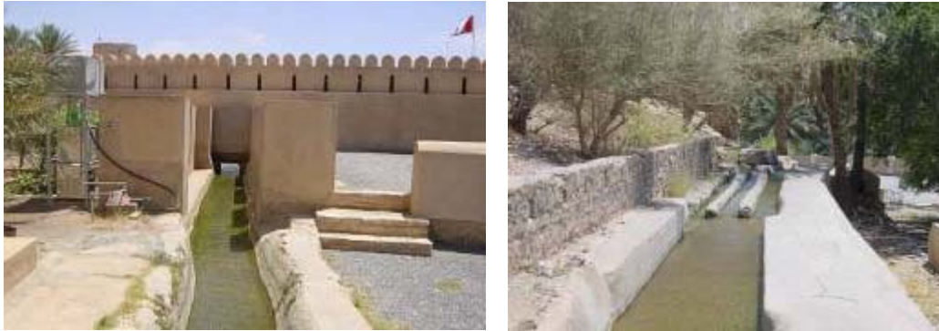
Falaj Al-Khatmeen: The shari'a passing beneath Bait Al-Redadah Fort ( left ).

Distribution point at the end of the shari'a ( right )