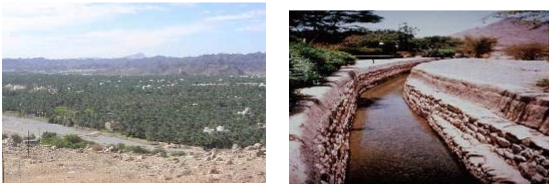
Falaj Daris: General view of the agricultural demand area ( left ). Sharīʿa ( right )

The largest in the Dakhiliyah Region, this da'ūdī falaj is thought to be the oldest active falaj in the Sultanate, built early in the Ya ʿ āribā Imamates period. The total length of its three channels is 7,990 m. Most of the water derives from the Wadi Al Abiyadh. The water flow reaches over 2,000 l/s, but the aquifer has been affected as a result of development pressures and so the flow rate falls during periods of drought.