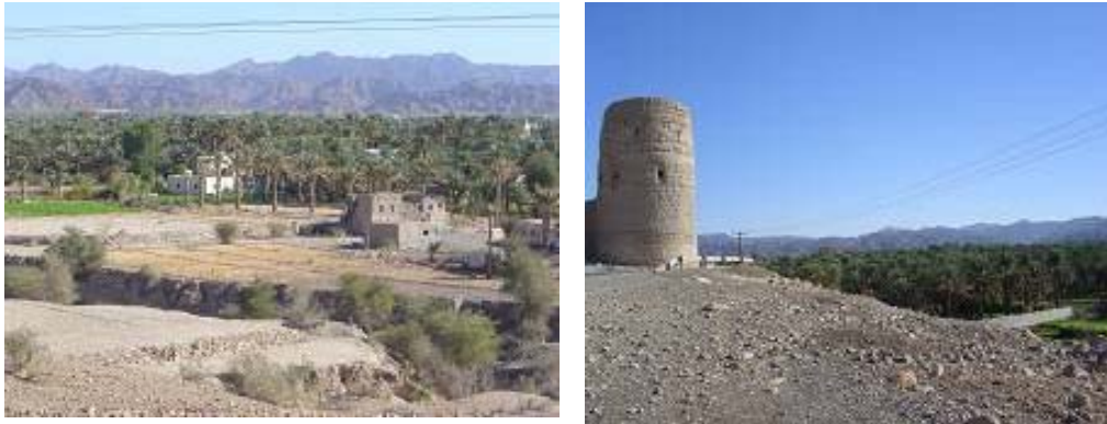
Falaj Al Malki: Traditional houses ( left ). Watchtower ( right )