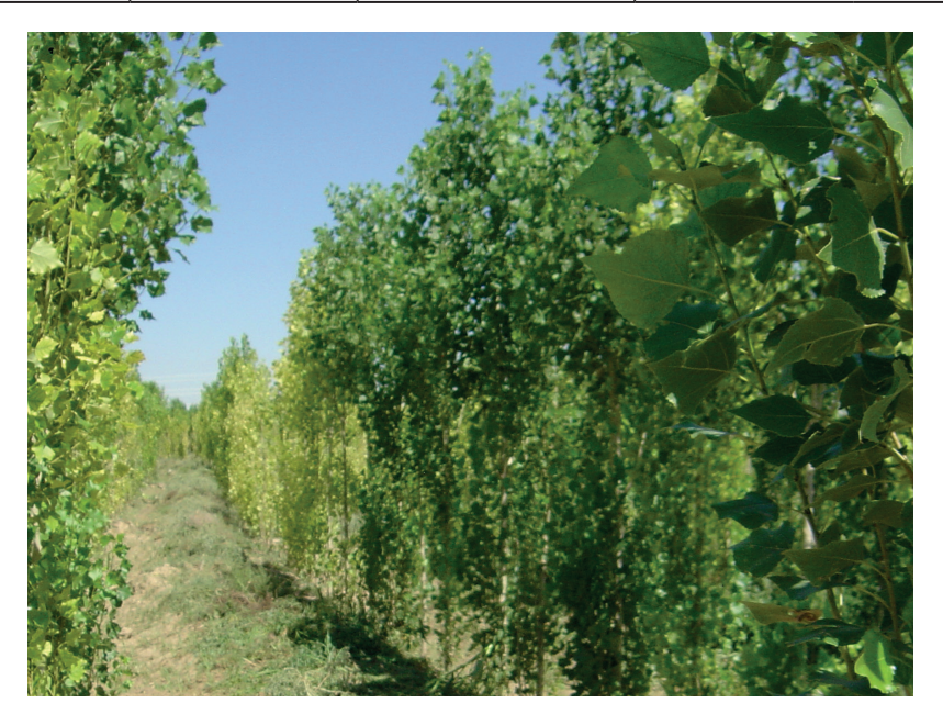
Poplar trees planted in Kashafrud area (in suburb of Mashhad city in the Khorassan province in IRAN – 2010)