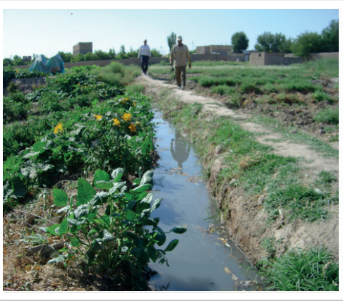
Fig. 1 Irrigating eatable products with untreated wastewater in Kashafrud- Mashhad- IRAN