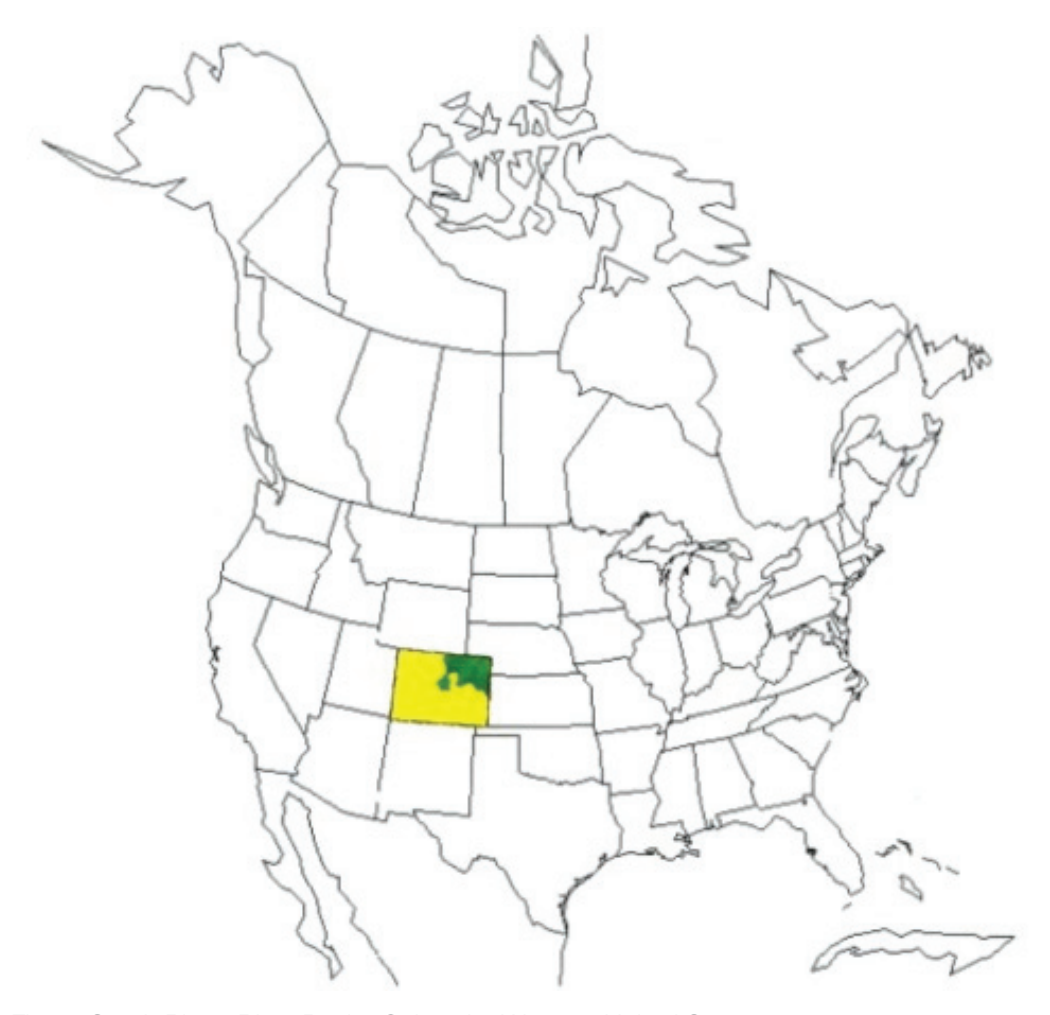
Fig. 1. South Platte River Basin, Colorado, Western United States.

Concerned about the negative effects of buy and dry on agriculture, rural communities, and even the environment, the State of Colorado has funded research into alternatives to permanent transfer of water from agriculture. These methods allow farmers to share water to which they have rights in ways that prevent permanent sale of the water. Such methods include interruptible water supply agreements, rotational fallowing, water banking and reduced consumptive use through changed irrigation and farming practices.